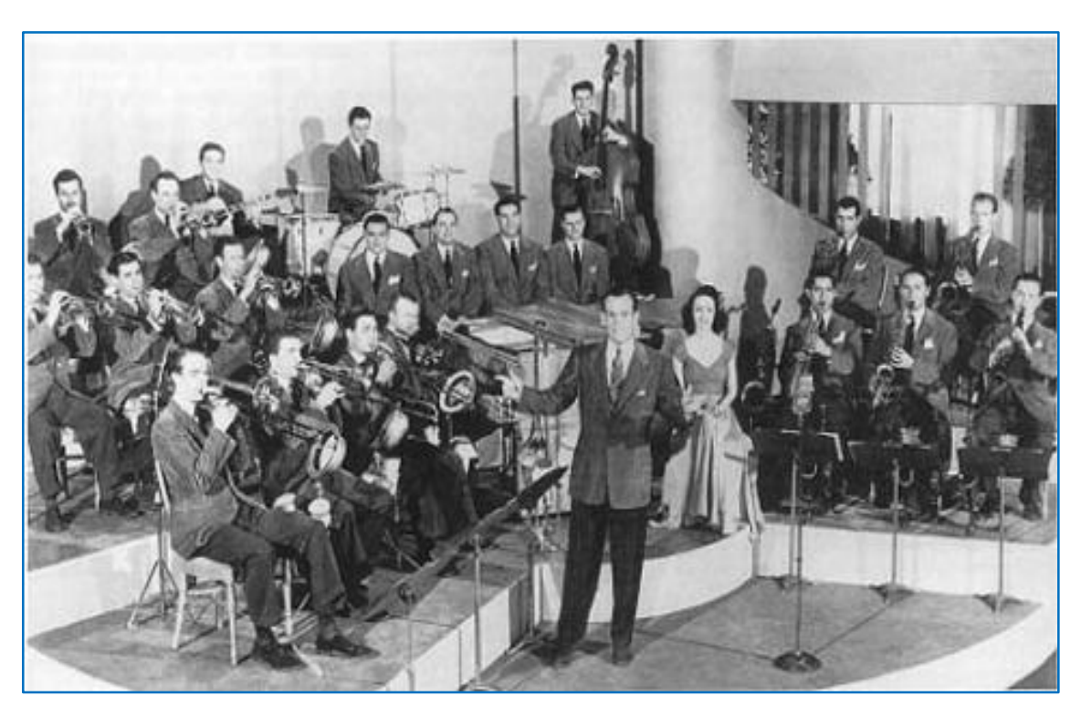
Sun Valley Serenade, 1941