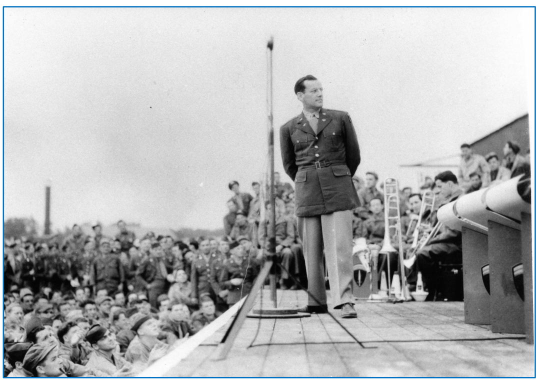
Concert, USAAF Podington (Station 109), August 25, 1944