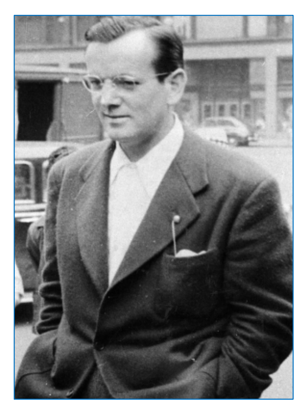
Glenn Miller Enlists, September 1942