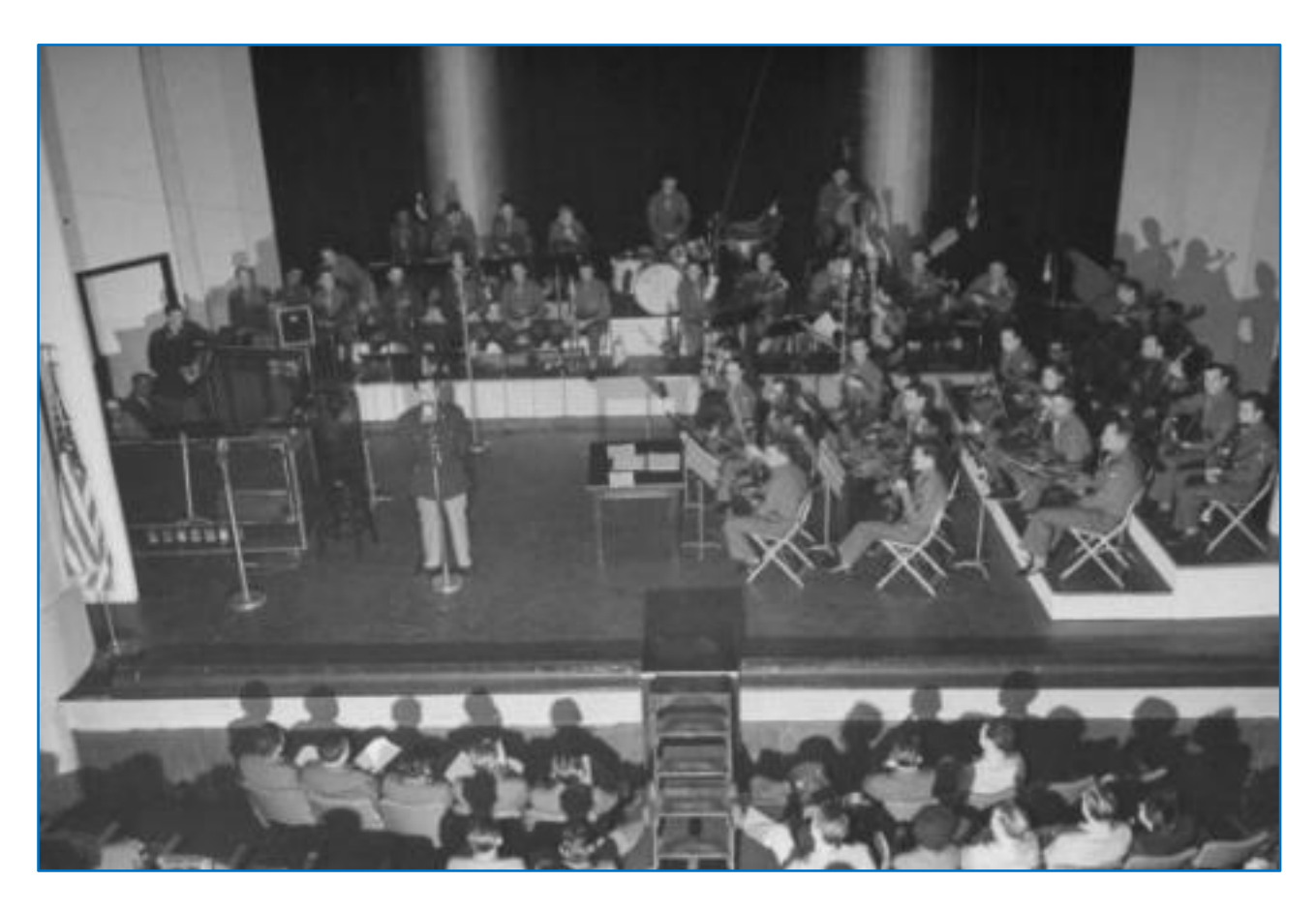
"I Sustain the Wings" Broadcast, 1944, NBC, Vanderbilt Theatre, New York

The orchestra commuted weekly from New Haven to New York for the purpose of broadcasting their network radio program. Once they moved to NBC, "I Sustain the Wings" was broadcast from the NBC Vanderbilt Theatre studio. In addition to their network program, the orchestra also had other important recording responsibilities.