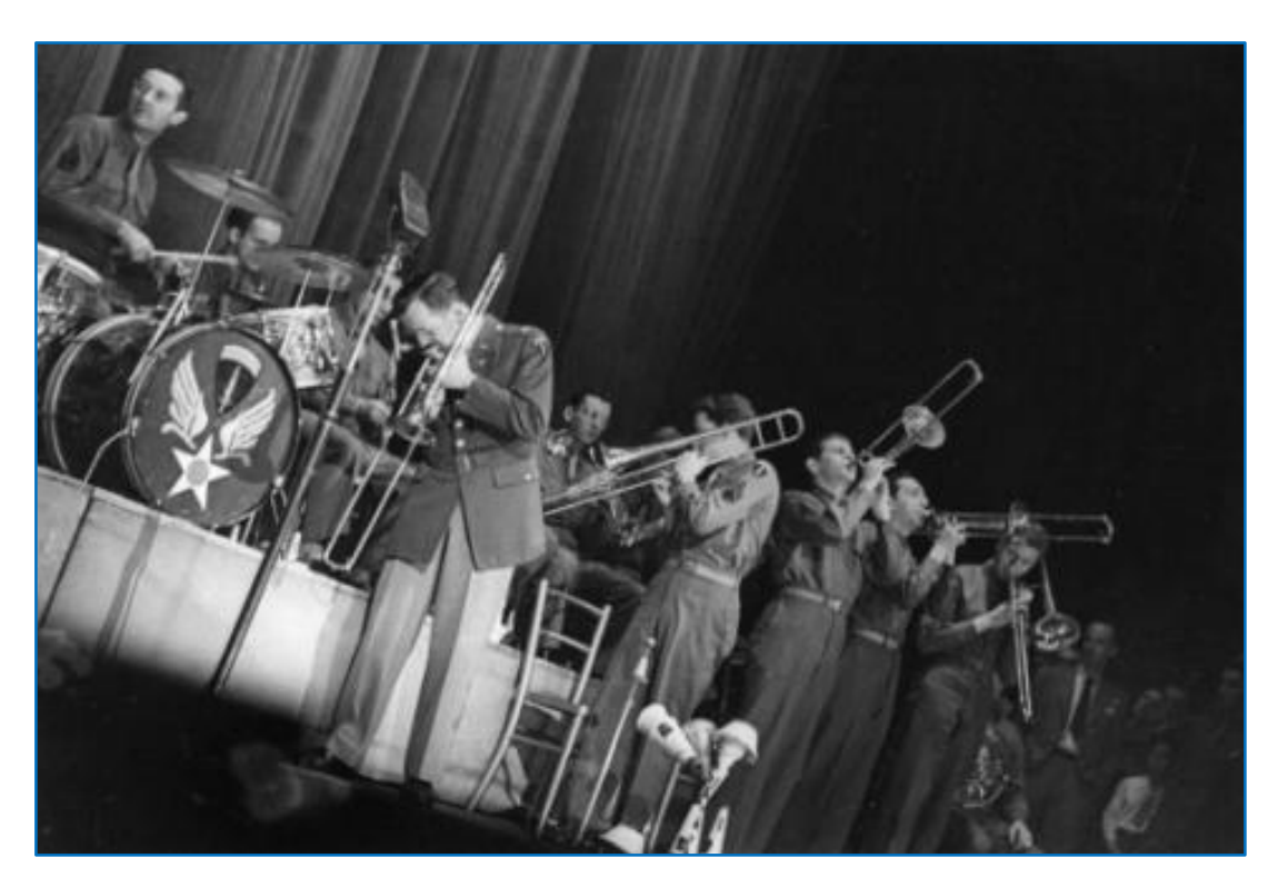
"Jazz Jamboree," London, October 1944